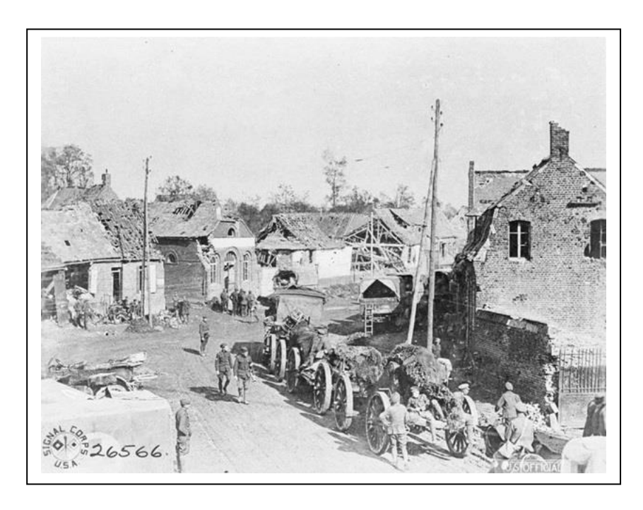
British heavy artillery passing through Montbrehain

He is buried at Calvaire Cemetery, Montbrehain, north of Saint Quentin. This village was taken on 3 October 1918, by three battalions of the Sherwood Foresters of the 46th Division, but it could not be held at the time; it was finally captured by the 21st and 24th Australian Infantry Battalions two days later. This action breached the German Hindenburg line and allowed the British to advance another 17km in the following days.