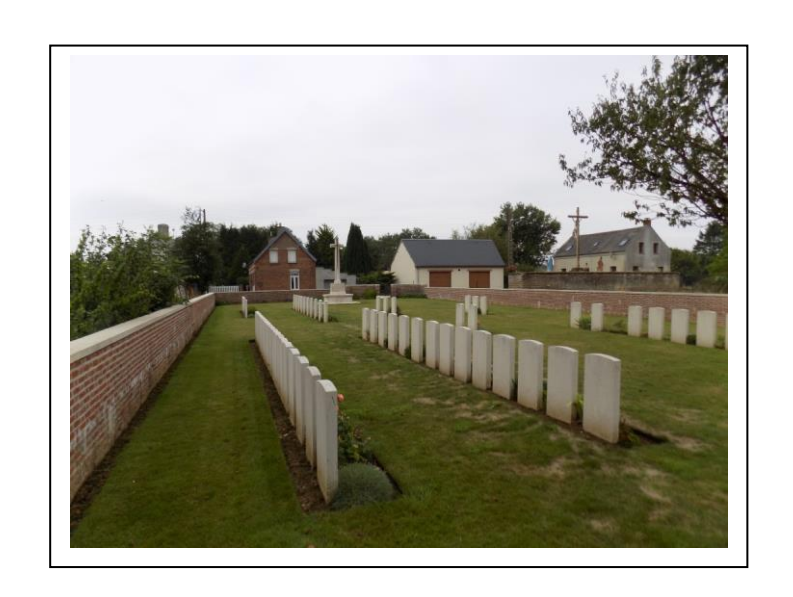
Stanley is buried at grave reference 1A.