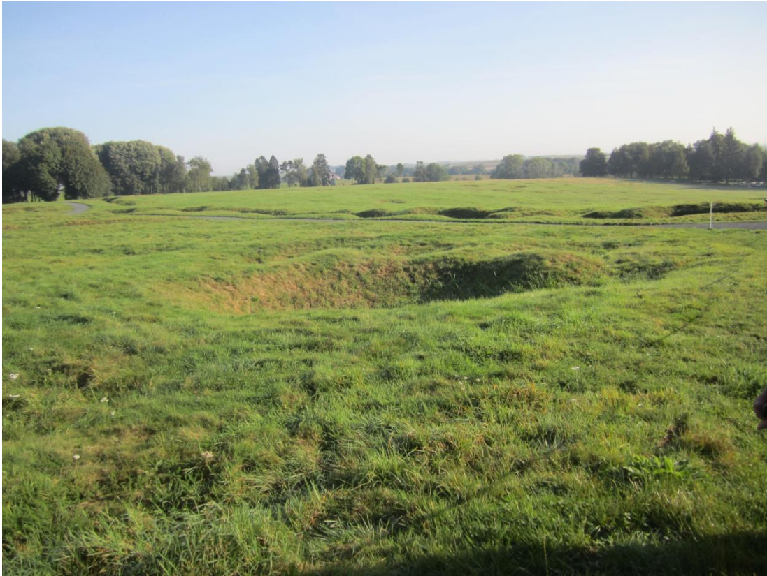
These photographs taken in September 2016 illustrate the now green cratered ground and preserved trenches at Beaumont-Hamel.