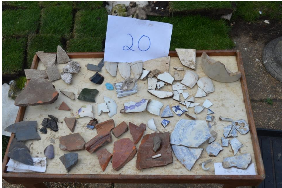
10-20 cm pit 3