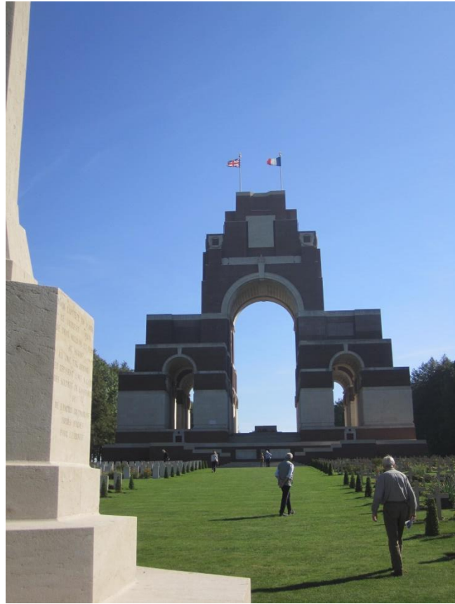
These photographs taken in 2016 show the Thiepval memorial and poppies and crosses planted on a nearby bank to mark the 100 th anniversary of the Battle of the Somme.